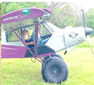
First ride in a plane