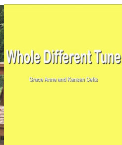
Whole Different Tune