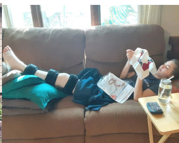
Hope cross-stitching while recovering from knee surgery