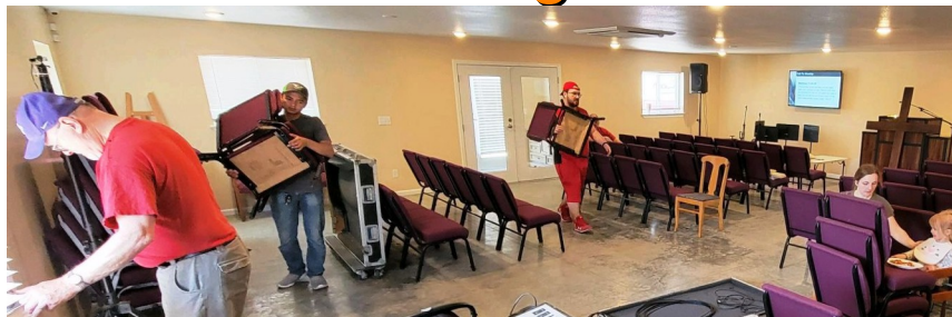
Church volunteers setting up inside our new building at 9050 Hwy. 24