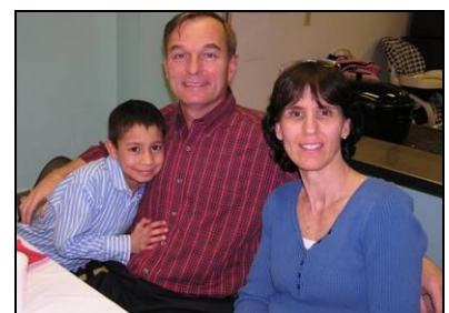
A new family in our church!