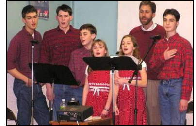
Our family loves to sing!

Would you please pray for me to balance my time wisely between my two congregations (my family & Christ the Redeemer Mission Church) so that both congregations are well-shepherded and fruitful in God's kingdom?