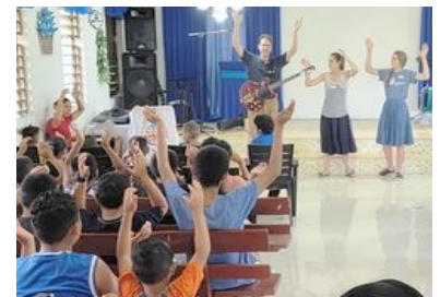
Leading singing at VBS in Belize.