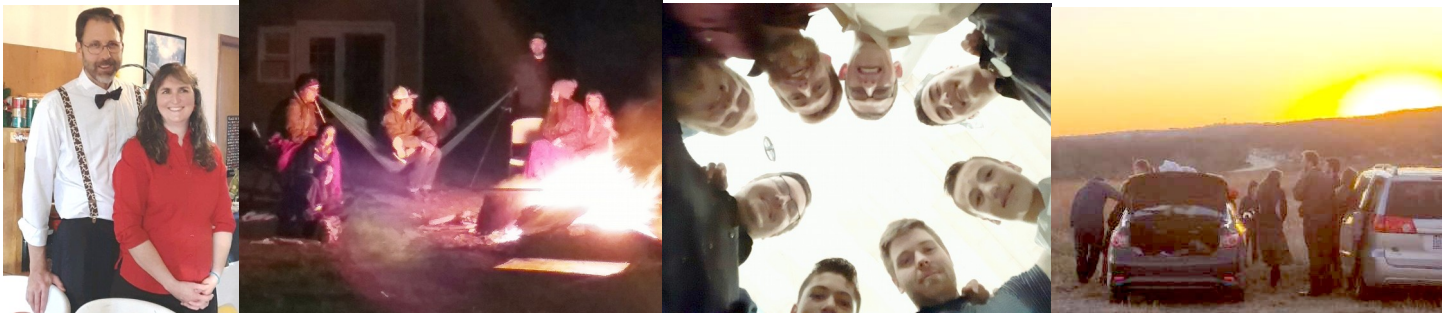
In addition to hosting many meals at home for life-on-life equipping, we also hosted bonfires & sunset-watches during COVID!

One of the things that came through loud and clear during my sabbatical studies last fall was that church elders must focus on shepherding (a.k.a. pastoring) God's people. A corollary lesson is that, just as Jesus was choosy about who He discipled, I must also make strategic shepherding choices; I don't have to say yes to every request. One of the practical outcomes is that I've decided to shift the balance of my ministry time in order to invest