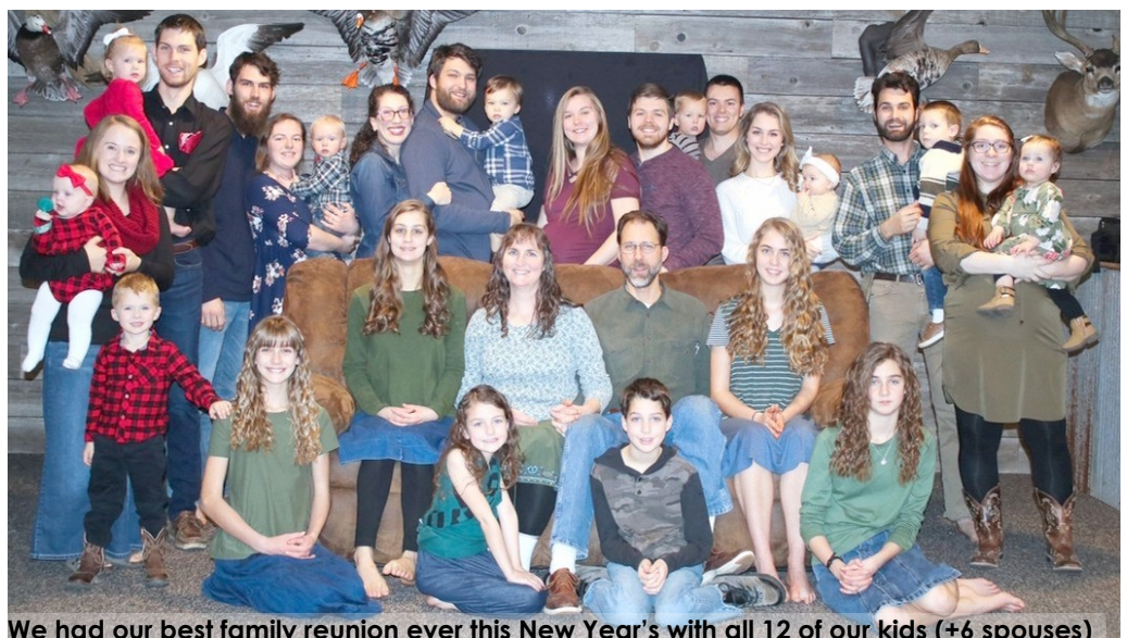
We had our best family reunion ever this New Year's with all 12 of our kids (+6 spouses) and 9 grandkids (+5 on the way)! You can listen to our sons' messages and family music-in-the-making at http://www.natewilsonfamily.net/FamilyGathering2021.html